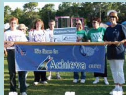
Volunteers at the American Cancer Society's Relay for Life, Tarpon Springs Sports Complex.