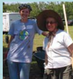
Volunteers at the Let Them Be Kids Initiative, Ross Norton Recreation & Aquatic Complex, Clearwater.

The Ross Norton Recreation & Aquatic Complex in Clearwater lacked a decent playground for neighborhood children. On