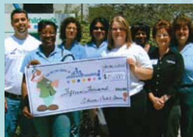
Volunteers at the 25 th Annual All Children's Hospital Telethon, St. Petersburg.

On Sunday, June 1, Achieva volunteers fielded calls at the 25 th Annual All Children's Hospital Telethon. Achieva's $15,000 donation contributed to total proceeds of over $4.2 million! All proceeds benefit All Children's Hospital in St. Petersburg.